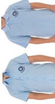
Unisex Short/Long Sleeved Sky Blue Polo or Sky Blue Short/Long Sleeved button-up Shirt - Lowes