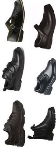
ALL BLACK SCHOOL SHOE All Black boots, Black Lace up or Velcro tab black shoes