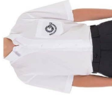
Unisex Short/Long Sleeved White Button up Shirt - Lowes