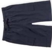
Navy Blocker Short -Lowes