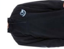
Unisex Zip Front Fleece Pullover- Lowes