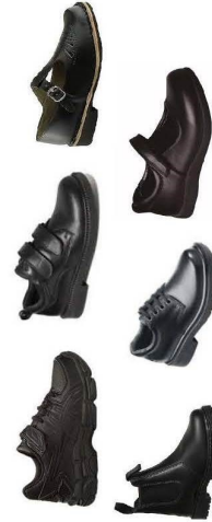
ALL BLACK SCHOOL SHOE All Black boots, Black Lace up or Velcro tab black