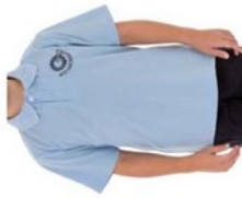
Unisex Short/Long Sleeved Sky Blue Polo Top - Lowes