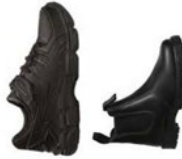
ALL BLACK SCHOOL SHOE All Black boots, Black Lace up or Velcro tab black shoes