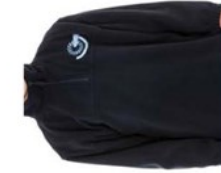
Unisex Zip Front Fleece Pullover- Lowes