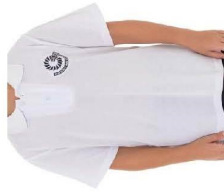
Unisex Short/Long Sleeved White Polo Top - Lowes