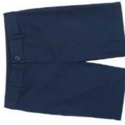
Navy Blocker Short - Lowes