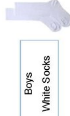
Boys White Socks