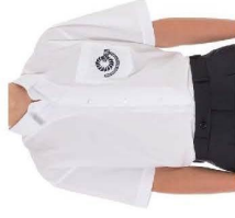
Unisex Short/Long Sleeved White Button up Shirt - Lowes