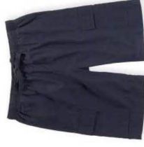
Navy Blocker Short - Lowes