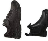
ALL BLACK SCHOOL SHOE All Black boots, Black Lace up or Velcro