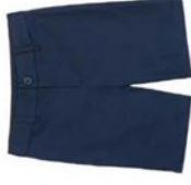
Girls Navy Dress Short worn with Sky Blue short sleeved Polo or Sky Blue button-up shirt - Lowes