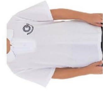
Unisex Short/Long Sleeved White Polo Top - Lowes