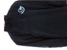
Unisex Zip Front Pullover- Low