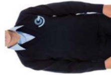
Unisex Woollen Pullover - Lowes