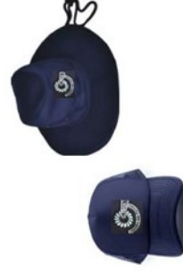
HATS - Cap, Bucket Wide Brim . Flat Brim Coming Soon - Available At HCS Office