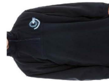
Unisex Zip Front Fit Pullover- Lowes