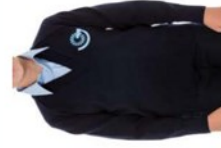
Unisex Woollen Pullover - Lowes