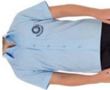
Unisex Short/Long Sleeved Sky Blue Button up Shirt - Lowes