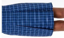
Tartan Summer Skirt - Lowes