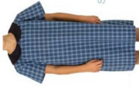
Primary Girls Summer Dress- Lowes